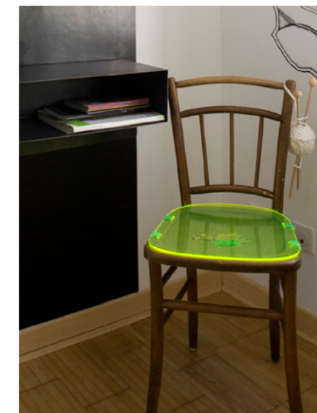
Gaëlle Villedary Réminiscence