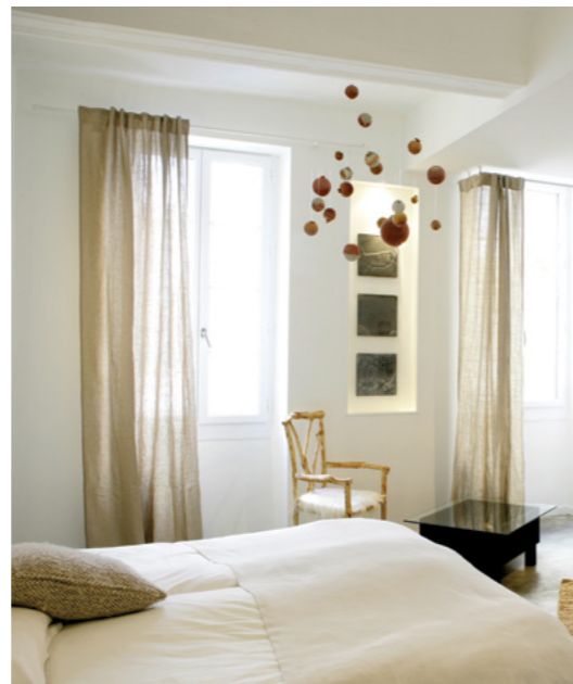
Milène Guermont Polysensual