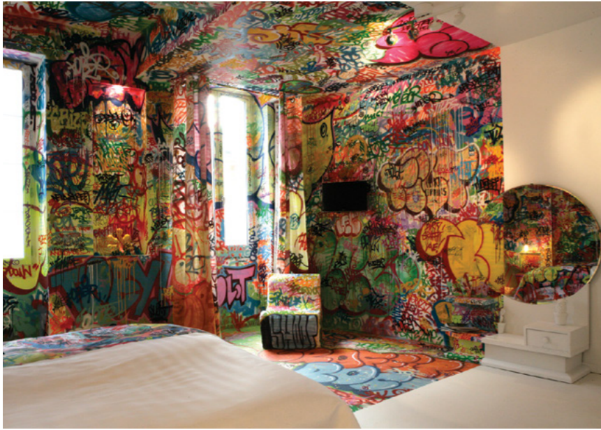
Tilt Panic room