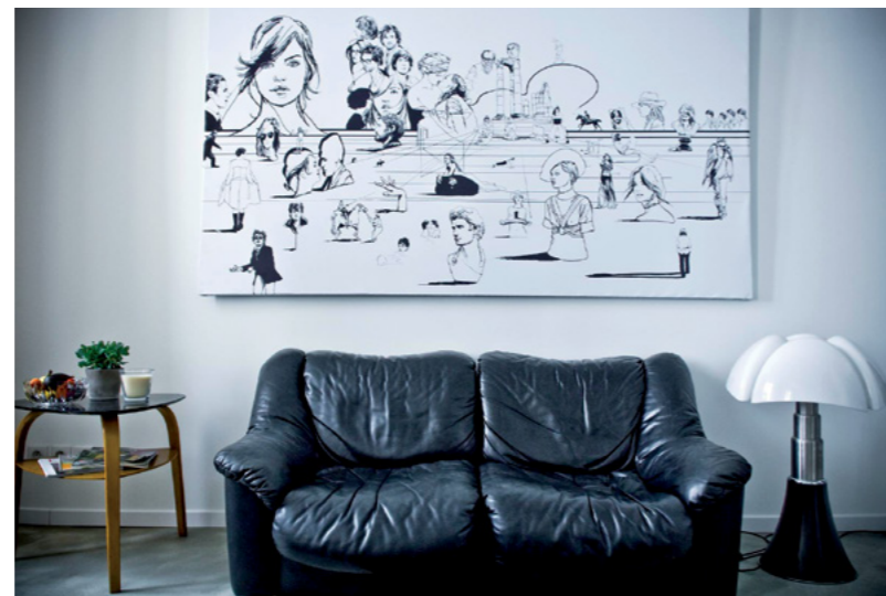
Stéphane Manel White lines