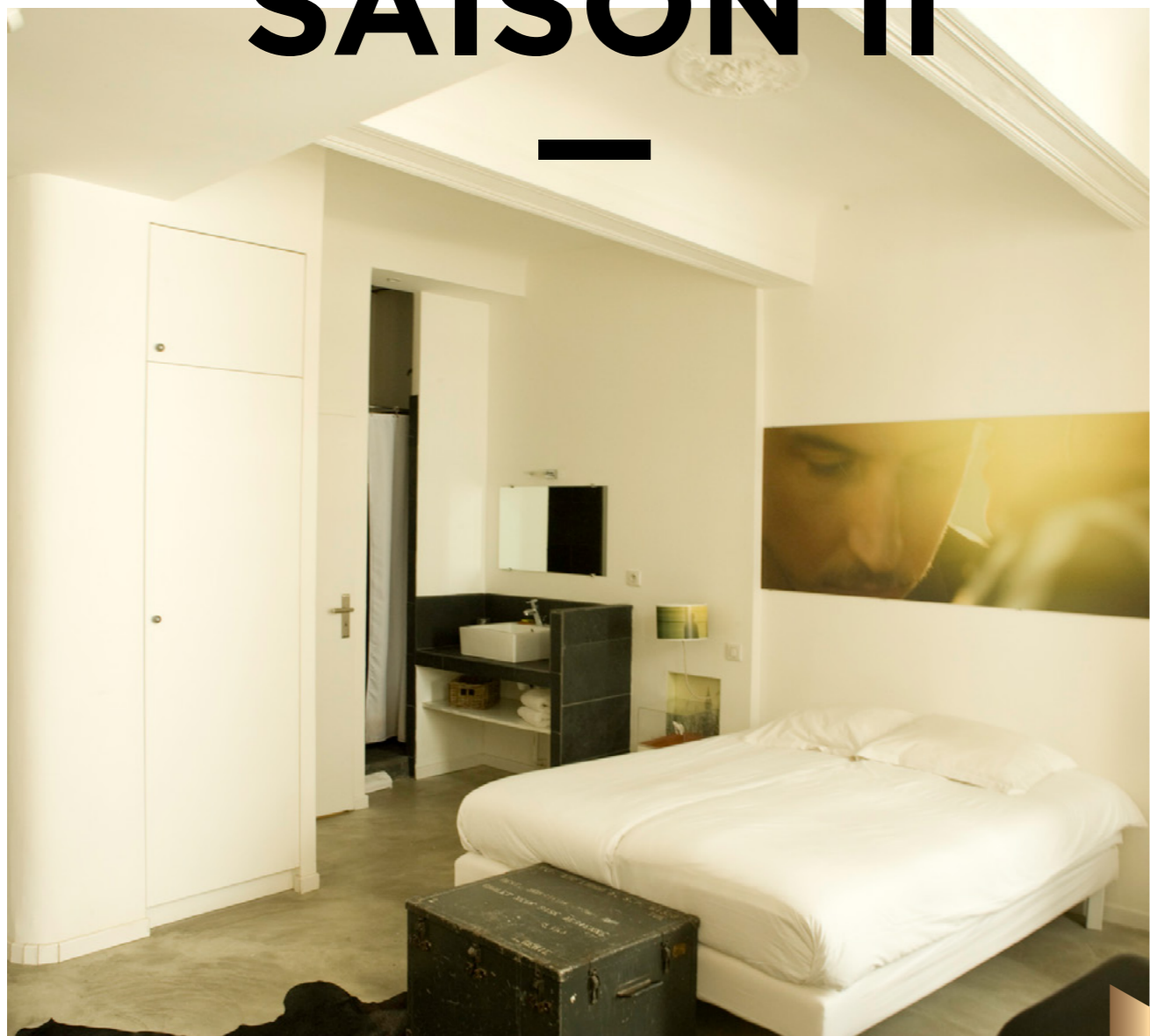
CLÉMENT JOLIN MUR - MUR